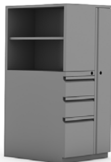
51"H Storage Tower (Handed L or R - R Shown)