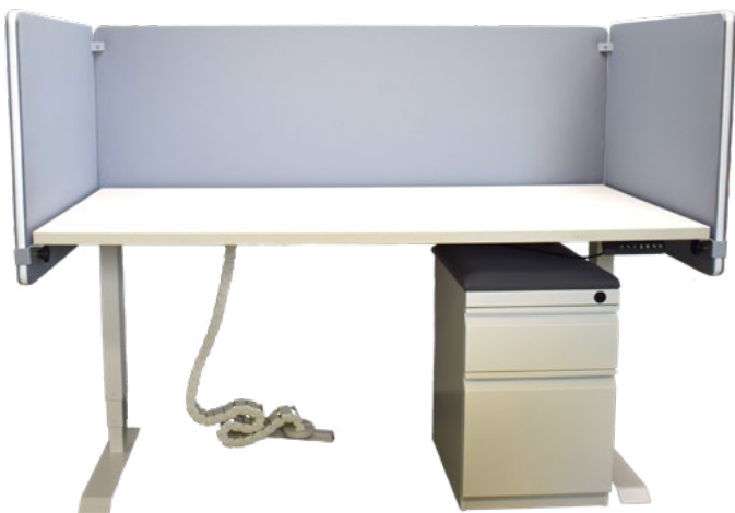
24mm PET Board Screens