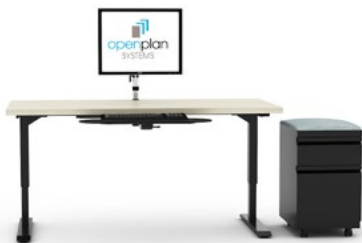
Straight Base | 2-Stage | C-Leg