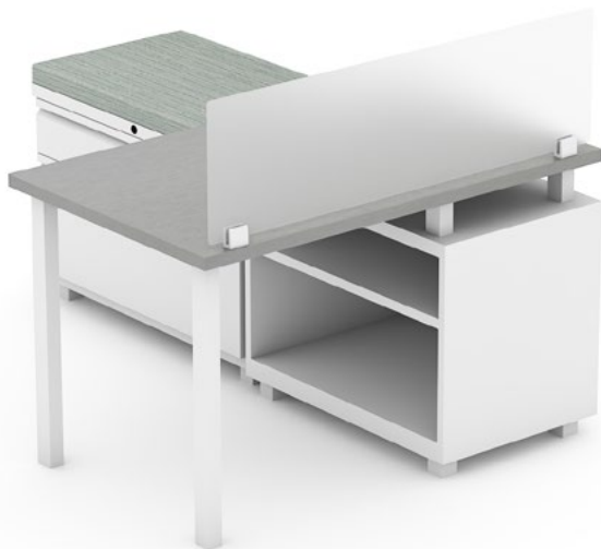
Glass & Plexiglass Screens