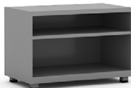
Low Storage, Open Shelf