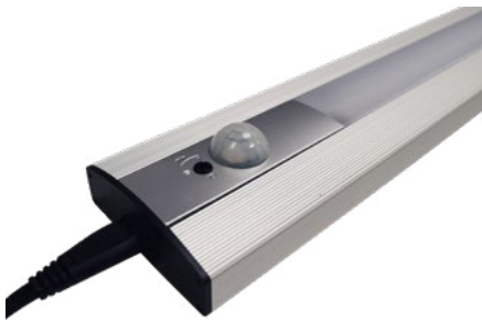
Led Task Lighting

Compliment any office with our keyboard sets, monitor arms, LED task lights, paper management and more. The variety of style and functionality are sure to set off any station. Feel secure in knowing your workspace is fully capable to adapt to ever-changing advances.