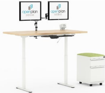
Budget Base | 2-Stage | T-Leg