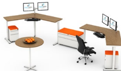
120 Base | 3-Stage | T-Leg