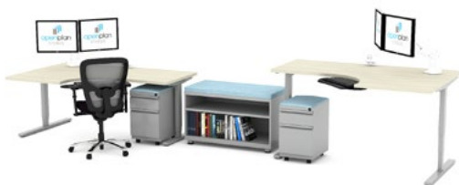
Extended L | 3-Stage | T-Leg