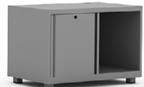
Low Storage, Sliding Door