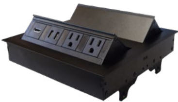
Desktop Power & Duplexes