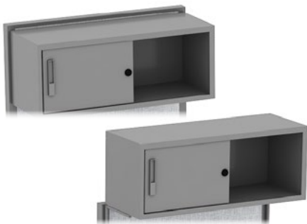
Storage Cabinet w/ Sliding Door