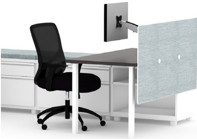
Desk Screen Dividers