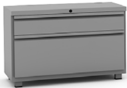
Low Storage, 2 Drawer