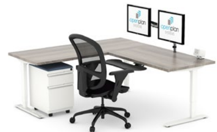
90 Deg Base | 3-Stage | C-Leg