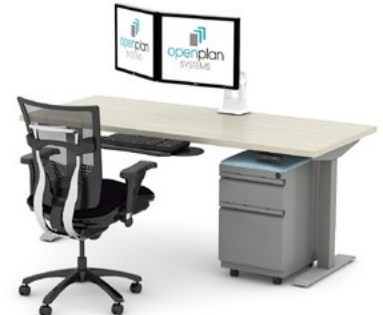
Straight Base | 2-Stage | T-Leg