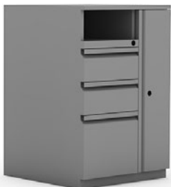
37"H Storage Tower (Not Handed)