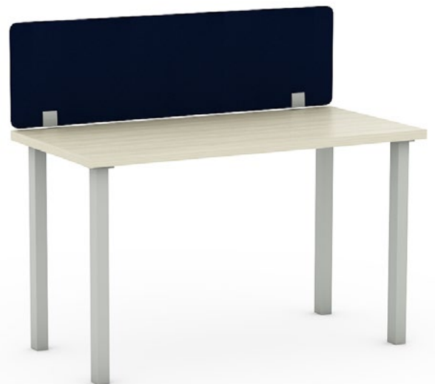
12mm PET Board Screens