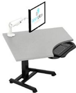
Single Base | 2-Stage