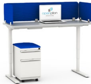
Straight Base | 3-Stage | C-Leg