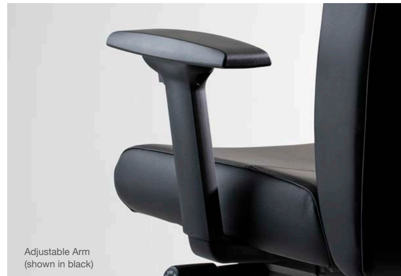
Adjustable Arm (shown in black)