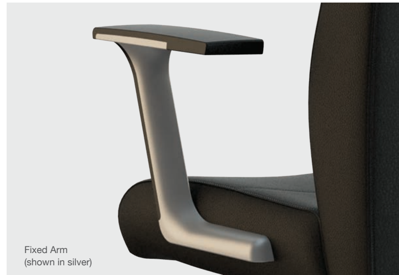
Fixed Arm (shown in silver)