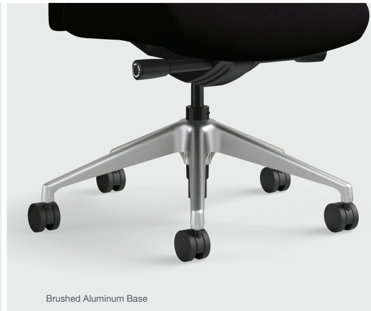
Brushed Aluminum Base