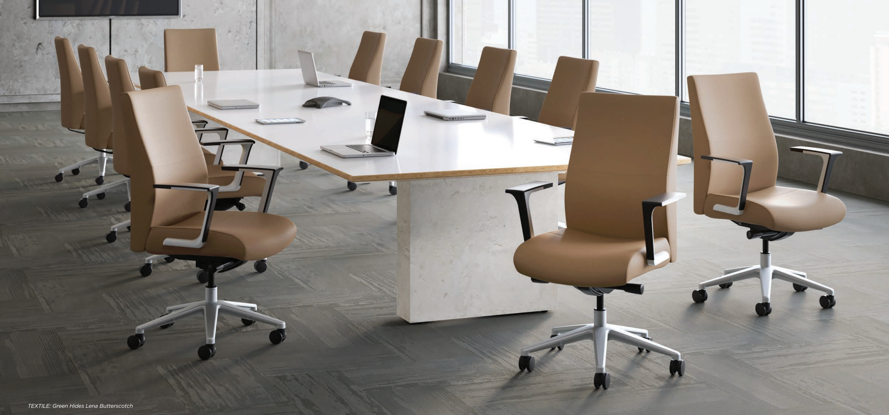
TEXTILE: Green Hides Lena Butterscotch