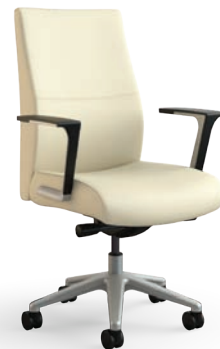
MIDBACK TEXTILE: Green Hides Lena Dover

Outfit Prava® with a wide variety of textiles, from fabric to leather to vinyl. Zippers are now available in white for white and light-colored upholstery, as well as black.