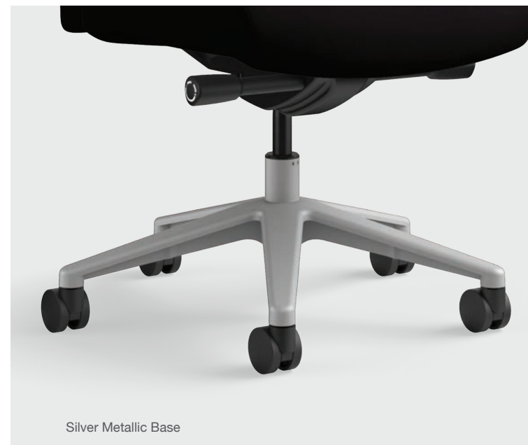
Silver Metallic Base