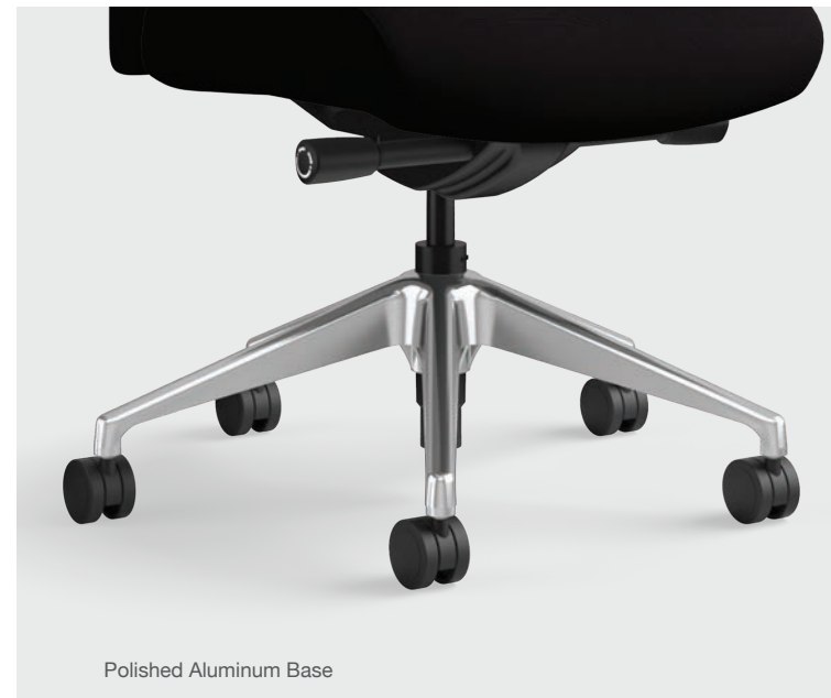
Polished Aluminum Base