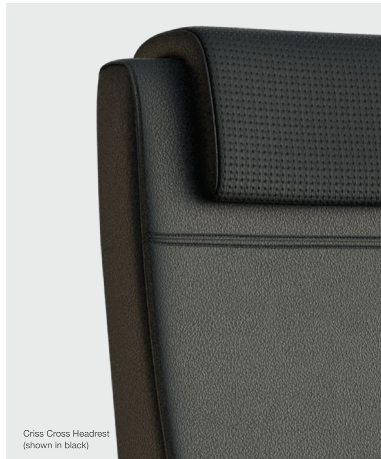
Criss Cross Headrest (shown in black)

Our Prava's mixed-media arm bears Pensi's signature, cast-aluminum design—the contemporary fusion of aluminum and plastic adds a subtly modern touch to any room.