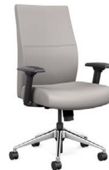
MIDBACK TEXTILE: Green Hides Sierra Mist