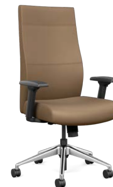
HIGHBACK TEXTILE: SitOnIt Slide Desert