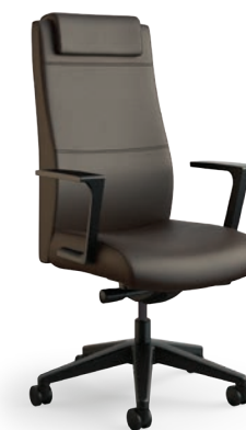
HIGHBACK (WITH HEADREST) TEXTILE: Green Hides Sierra Mahogany